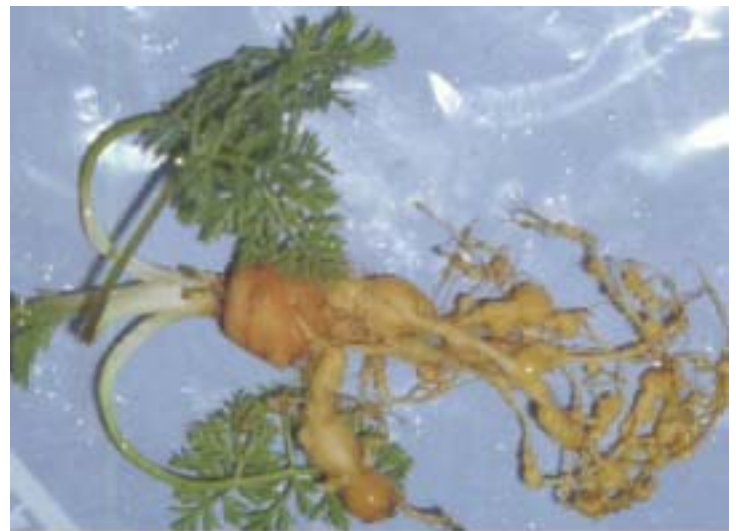
Figure 2. Obvious nematode "galling" on a carrot.

Root-knot nematodes don't do well in dry soils but obviously we can't fallow irrigated fields. Rotation with peanuts can be effective but is a limited practice because we can't plant enough peanuts to rotate all the nematode-infested problem fields.