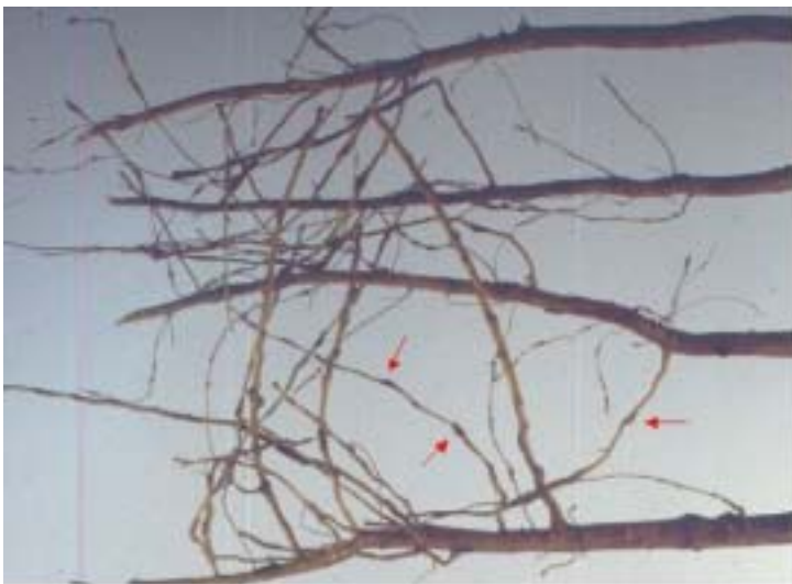
Figure 1. Root-knot nematode "galling" on cotton roots.

They can't be seen and their distribution can be spotty across a field but when nematodes are a serious problem, cotton plants can be severely stunted and their roots covered with galls or "root-knots" (figures 1 & 2). We have documented losses averaging 26% of the field's yield potential on half of the irrigated acreage in the Southern High Plains.