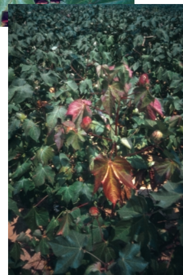
Figures 2, 3 and 4. Bronzing and reddening of foliage with bronze wilt.