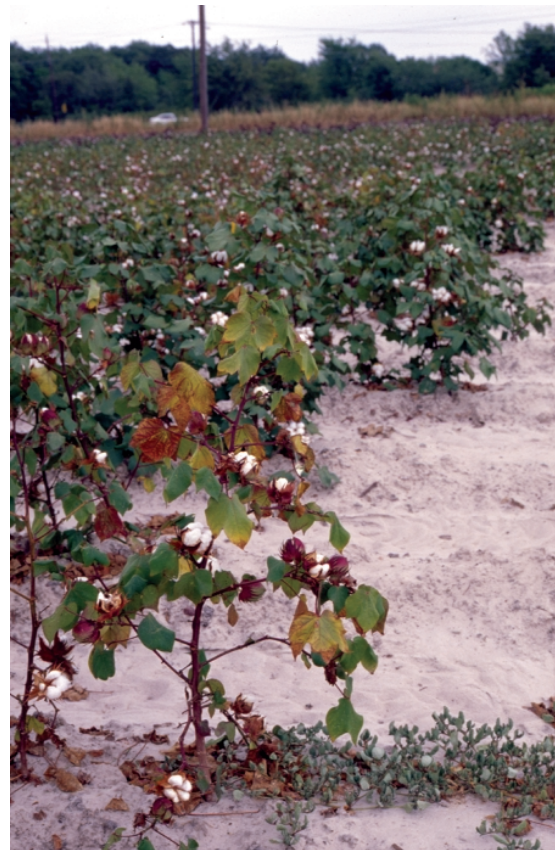
Figure 12. Plants at the end of a row affected by bronze wilt.

This publication was funded by Cotton Incorporated.