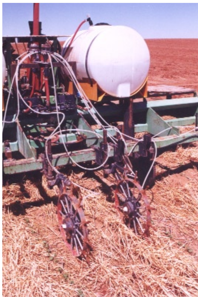
A liquid fertilizer rig, designed for variable-rate application, with spoke applicators. Note the cotton seedlings growing in the crop residue.

These extra costs include: grid soil sampling; additional laboratory analyses of a larger number of soil samples; and retro-fitting a liquid fertilizer rig with variable-rate equipment, GPS, and ground speed radar.