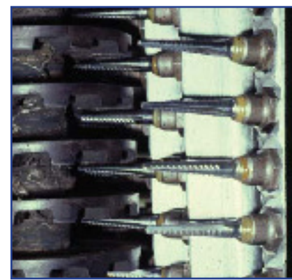
Improperly adjusted spindles will grind doffer pads, creating small rubber particles that contaminate cotton