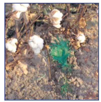
Care taken during harvesting will prevent debris, such as the plastic protruding from this module, from becoming a lint contaminant.