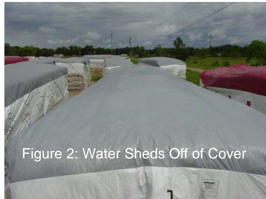
Figure 2: Water Sheds Off of Cover