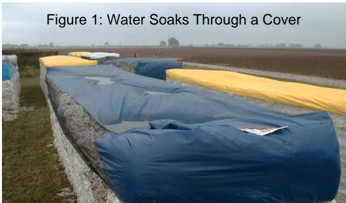
Figure 1: Water Soaks Through a Cover

* For EP1 gin, % Ponded was a combination of actual water ponded and depressed areas likely to hold water.